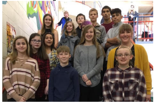
Some of the Clarkson-Leigh Jr. High students who attended the Stanton Music Festival.